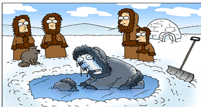
ANOTHER ESKIMO BAPTISM GONE BAD